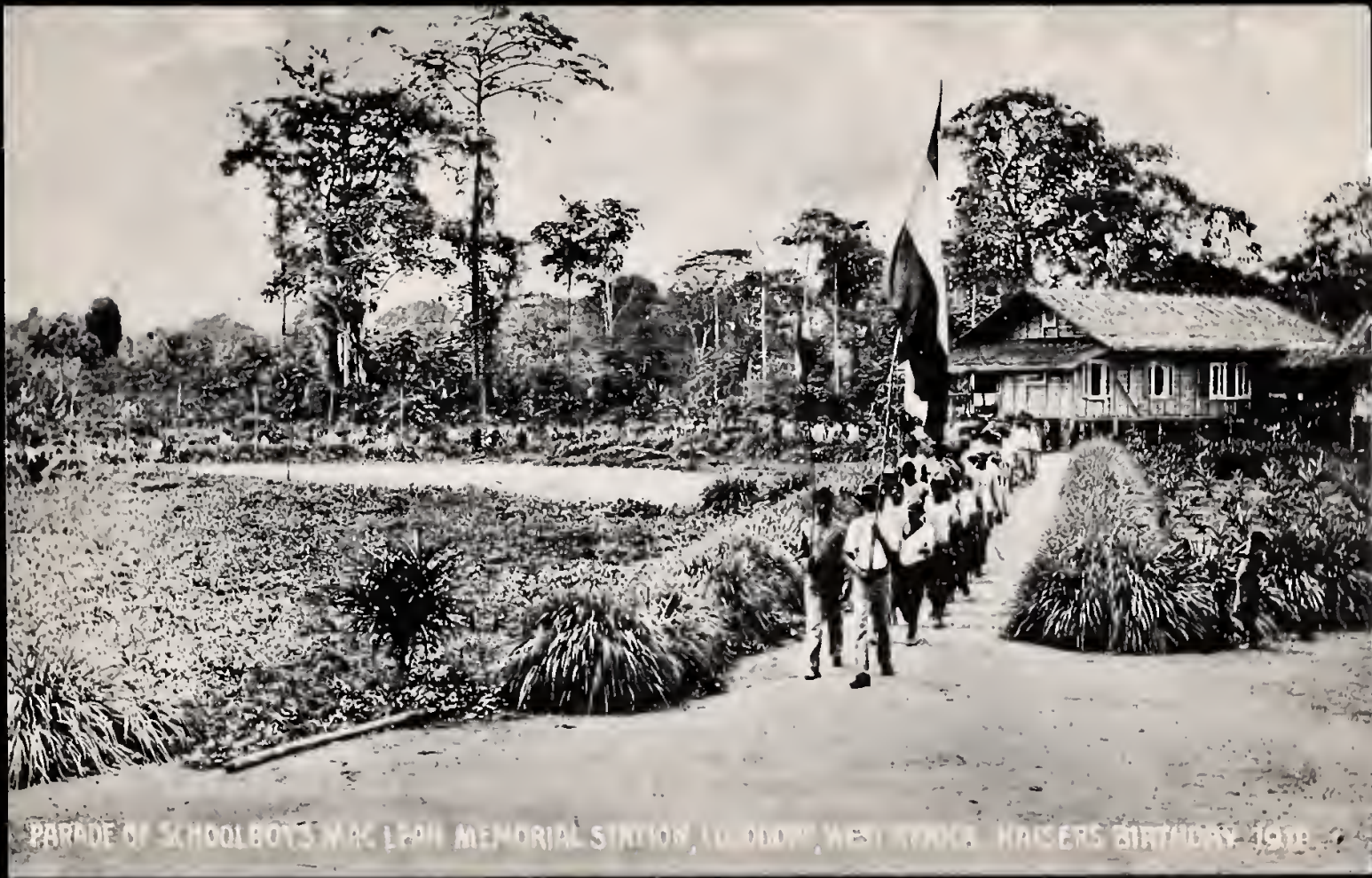
PARADE BY SCHOOLBOYS MAC LEAH MEMORIAL STATION, U. S. 6600', WEST TROPIC, HAWAII BIRTHDAY 1919